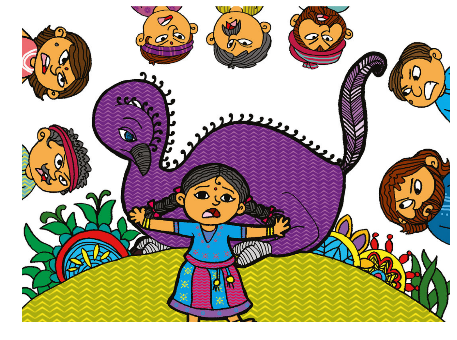
"Stop!" Munia's thin voice cut through the din. She limped between the mob and the giant.

"Munia! Come back at once!" her father ordered. "Grab her!" cried someone else.